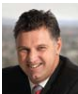
JUSTIN MADDEN MLC MINISTER FOR PLANNING

FOOTSCRAY* RENEWAL *[people culture opportunity]